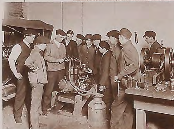
Emmerich Manual High School automotive repair class, 1916