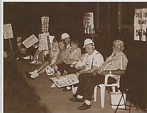
The Polis Center