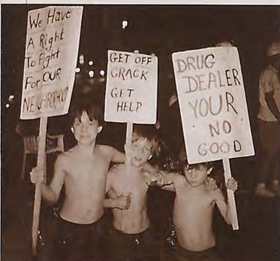
The Polis Center

Central Wesleyan Church moves to the neighborhood, locating at 1225 S. Laurel St.