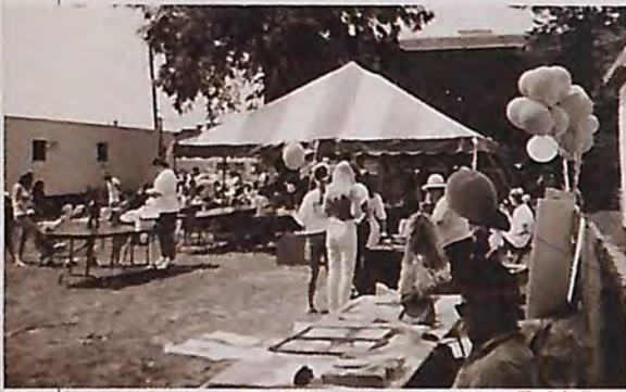
The Polis Center