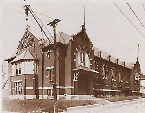
Indiana Historical Society, Bass Photo Co. Collection #c366