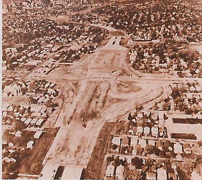
Indiana Department of Transportation