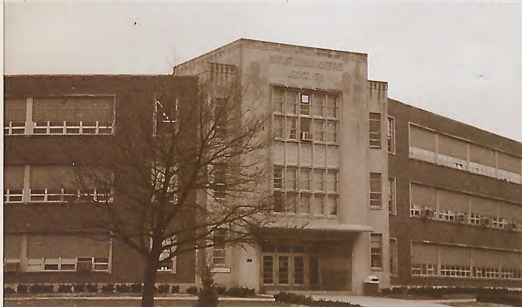
The Polis Center

1979 Fletcher Place Design Center, administered by the Southeast Multi-Service Center, is founded with Community Development Block Grant Program funds. Its purpose is to renovate homes for low-income families and the elderly.