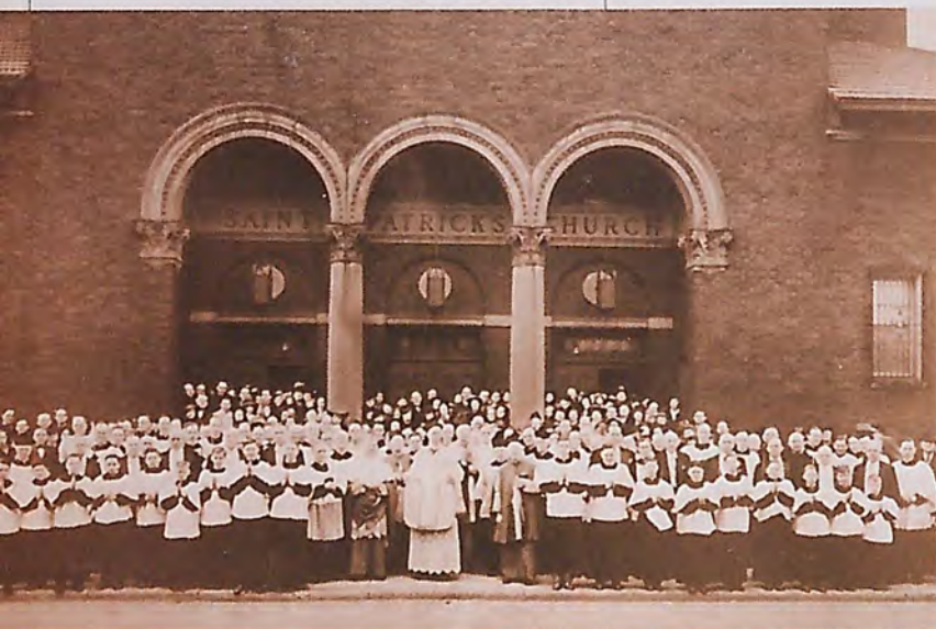
St. Patrick's Church