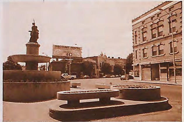
The Polis Center

1995 The Indianapolis Police Department's new South District Headquarters open at 1150 S. Sanders St.