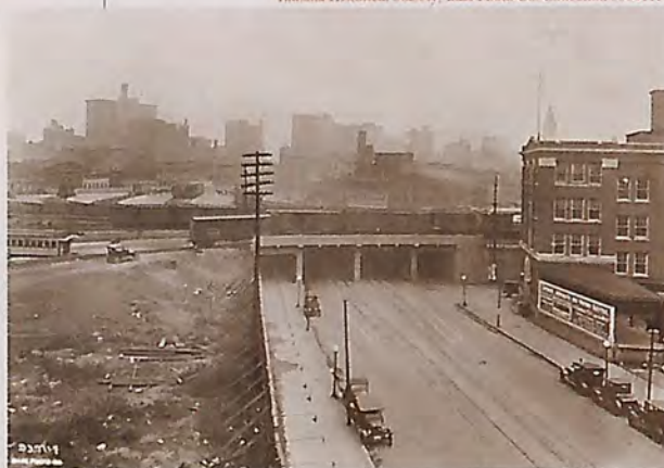
Virginia Ave. elevation looking northwest, 1925