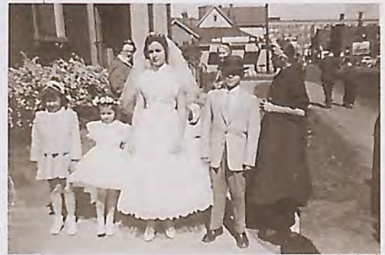
St. Patrick's Church

Fountain Square Church of Christ is organized by Irvington Church of Christ. The new congregation takes up residence in a building at Spruce and Prospect streets.