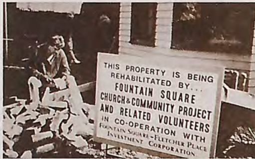
Fountain Square-Fletcher Place Investment Corporation

The Southeast Community Organization (SECO) forms and implements neighborhood clean-up, anti-drug marches, and crime-watch programs. With the assistance of Citizens Gas Co., it also constructs Bennet Field, a small baseball park.