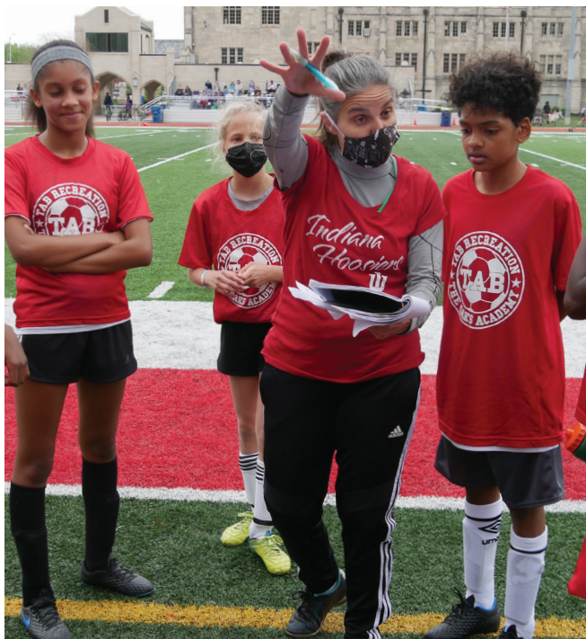
The Recreation Ministry of Tabernacle Presbyterian Church includes soccer games for youth age 12-14.

Of course, a congregation may define itself geographically even though its members live far from its service area. Examples include Tabernacle Presbyterian's youth sports programs or Bethel AME's urban ministries—both were congregations that stayed put long after their members had moved elsewhere (Bethel AME very recently moved northward too). The tension of building a community of members or serving as part of a neighborhood ecology is very real.