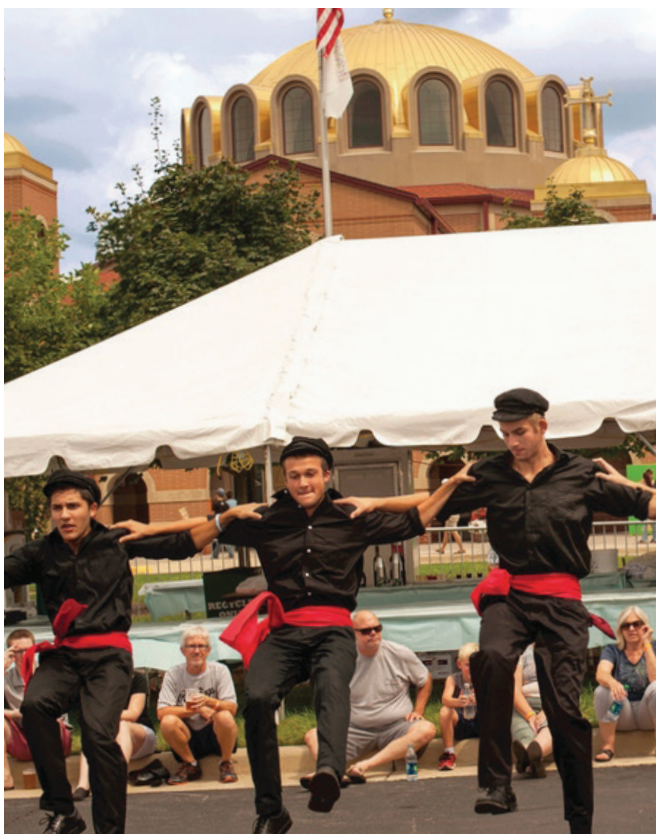
The Holy Trinity Greek Orthodox Church of Indianapolis hosts an annual family-oriented, festival celebrating the Orthodox faith and Hellenic culture with the community.

At times, a new congregation finds a home in an old congregation's house of worship. Consider the case of University Park Christian Church. Formed in 1930, as the result of the merging of two predecessor churches, University Park made its home at 29th and Kenwood. The congregation moved to 46th and Illinois in 1948. The church building at Kenwood became the new home to Second Christian Church, which later renamed themselves Light of the World Christian Church. After over thirty years, Light of the World prepared to move to a new location and its building became home to yet another congregation, New Liberty Missionary Baptist Church.