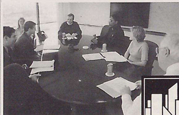
Roundtable discussion, p. 4

congregations chose to relocate to the newer areas, while others decided to reorient their church mission to the new environment. On the rural fringe, where small church buildings had sufficed for a small community, such facilities suddenly proved inadequate to accommodate the influx of suburbanites. In many new suburban areas, new churches were organized, and functioned as gathering and meeting places for entire neighborhoods of newcomers. In all of these situations, individuals experienced a changing sense of community. For some, the church served as a place to plant new roots; for others, it offered a chance to hold on to what roots they could. In short, religion served as an important mediating institution amidst rapid changes in the metropolis.